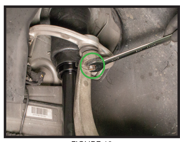
FIGURE 11 FIGURE 12